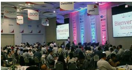
BKF International helped sponsor the recent IFRS Conference of the Americas in the city of Cartagena.