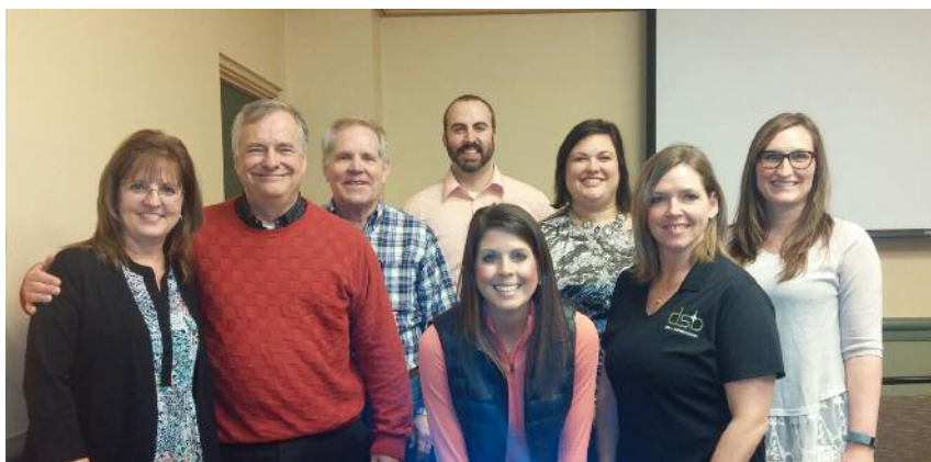
BKR's Medical Practices and Health Care Practice Group Meeting in Orlando, Florida, on January 21 & 22

I highly encourage any members that are "generalists" like myself that plan to grow their practices with physicians, clinics, or hospital systems, as well as specialized health care consultants, to prioritize these meetings in the future!