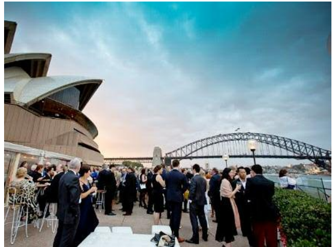
Walker Wayland - Sydney held an event to commemorate its 30th anniversary on November 28 at the Sydney Opera House.